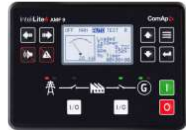
IntelliLite 4 AMF 9