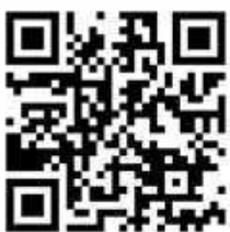
Scan for video